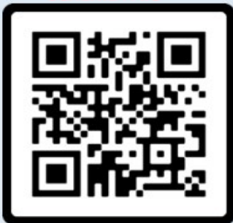
PATIENT ASSISTED TRAVEL SCHEME PATS

Please scan the below codes to access information.